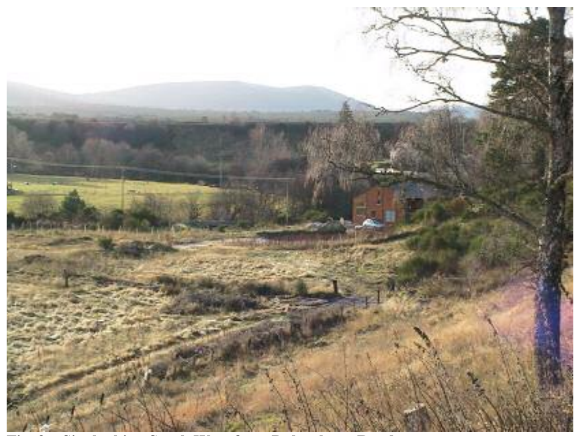
Fig. 2 – Site looking South West from Dalrachney Road