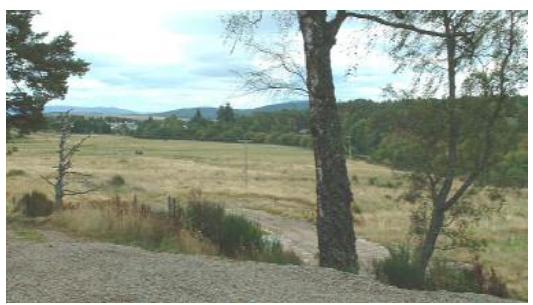
Fig. 3 - Site looking East from Dalrachney Road

3. The crofting lands at this location have been the subject of some development pressure in the last few years. In November 1999, Members of the Badenoch and Strathspey Area Committee of the Highland Council, decided to grant planning permission, against officer recommendation, for the erection of two dwellinghouses. One of these houses is "Allt Beag", the other is sited further to the south-west and is the subject of a condition restricting the occupancy to a person solely or last employed in the locality in agriculture. A third house exists in a position further towards the railway line. That property was the subject of a planning approval for refurbishment in 1999. There are therefore three houses located on this croft at present.